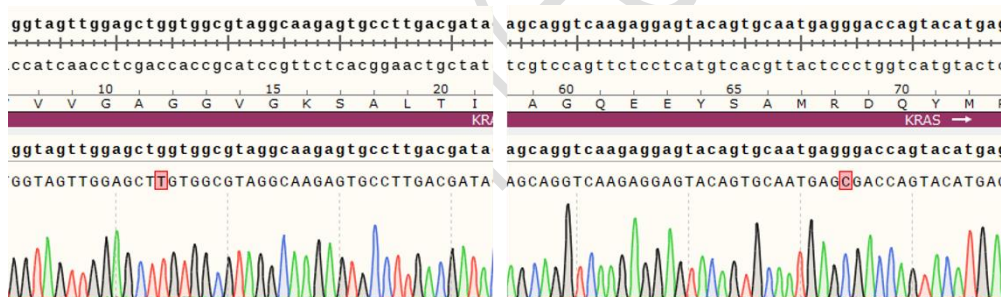
Figure 2 | The KRAS mutation analysis by Sanger sequencing.